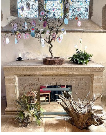
Funerals and support at difficult times.