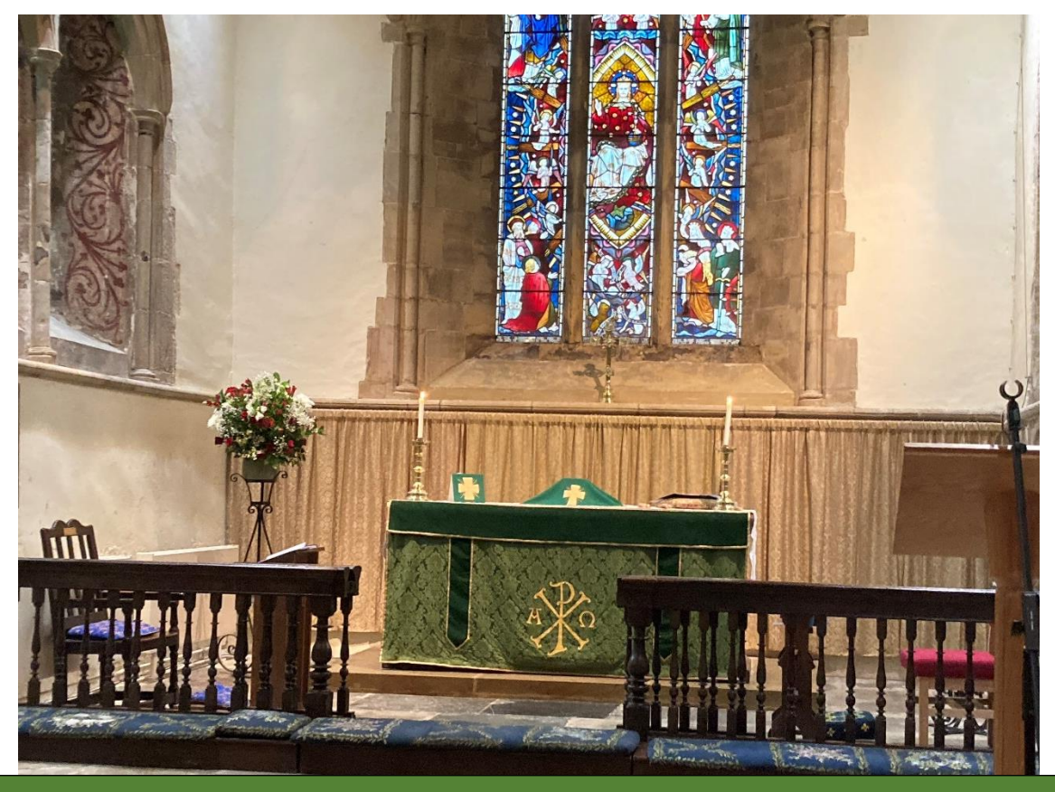
This is your Parish Church, in the heart of the village and the heart beat of life in the parish.