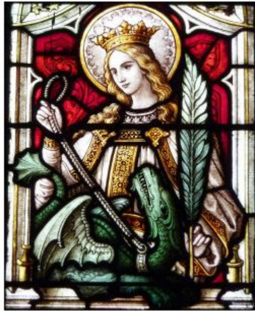
St Margaret of Antioch